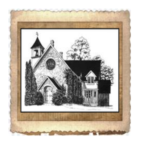
Celebrating the 1970's

Celebrating Fifteen (15) Decades of Service and Gratitude